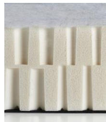
NORDIC Latex medium Fiberfill Latex core Fiberfill approx. 14 cm high