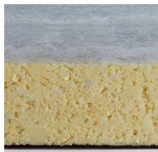
NORDIC Classic firm Fiberfill freon-free polyether foam Fiberfill approx. 14 cm high