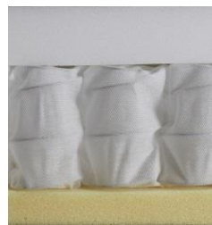
NORDIC Soft Spring extra soft 1 layer of hyper soft foam membrane bound pocket spring 1 layer of hyper soft foam approx. 18 cm high

Every single mattress is handmade with great care and attention to quality and details at the INNOVATION LIVING™ factory in Denmark.