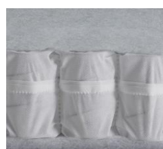
NORDIC Spring medium thick layer of fiberfill Pocket spring Fiberfill approx. 14 cm high