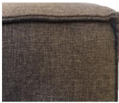
Sharp Plus Cover sharp