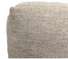
Nordic Cover round