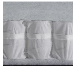
NORDIC Spring medium

Fiberfill freon-free polyether foam Fiberfill approx. 14 cm high